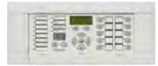
MiCOM P741 Central Unit