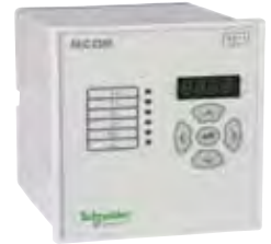
Flush mounted version