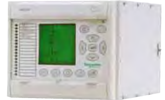
Option with graphic HMI