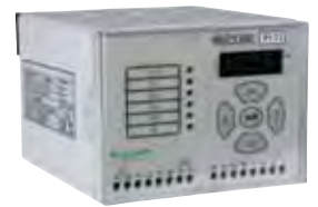
35 mm DIN rail version