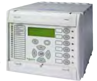
Option with text HMI