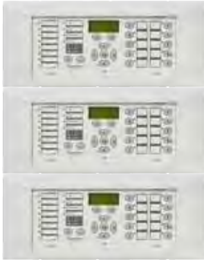
3-box mode (one per phase)