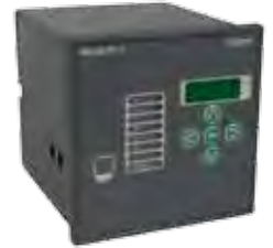
Flush mounted version