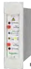
E124 capacitor trip unit