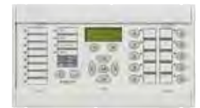
MiCOM P743 Peripheral Unit