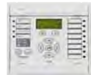
MiCOM P742 Peripheral Unit