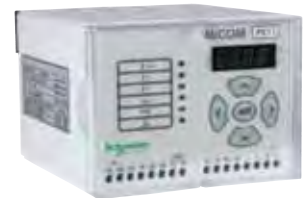
35 mm DIN rail version